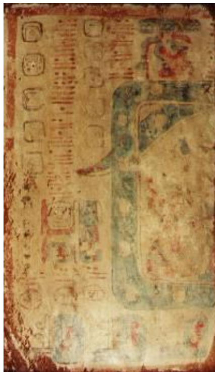
Photograph 9: Insert from the Prague Codex of the Maya

The Codex describes the events from the sacred 260-day Tzolkin Calendar (20 and 13-day cycles are given as parallel). The symbolic algorithm also points to the synodic cycle of Venus.