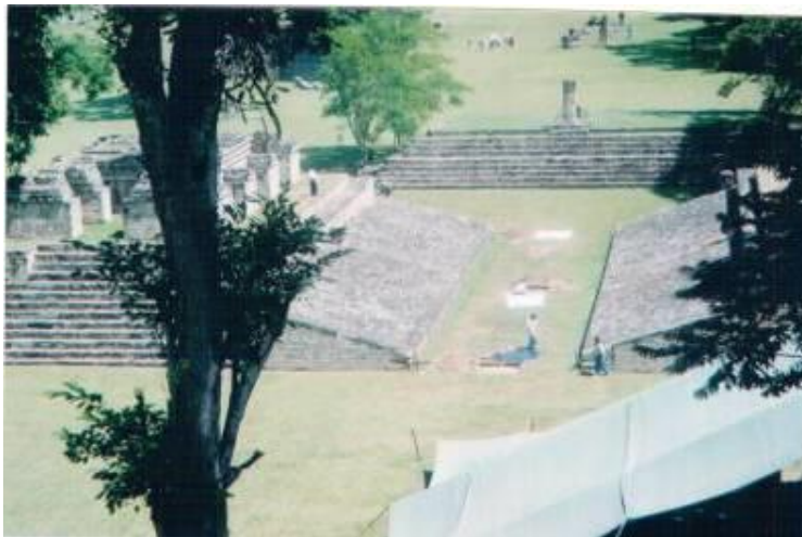
Photography 11: Acoustic effects at the Copana Play Field, Honduras