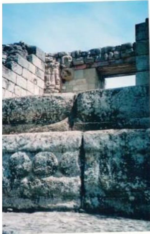
Photography 8: Nuber eight (dash and three dots) engraved into a stone block, Copan, Honduras