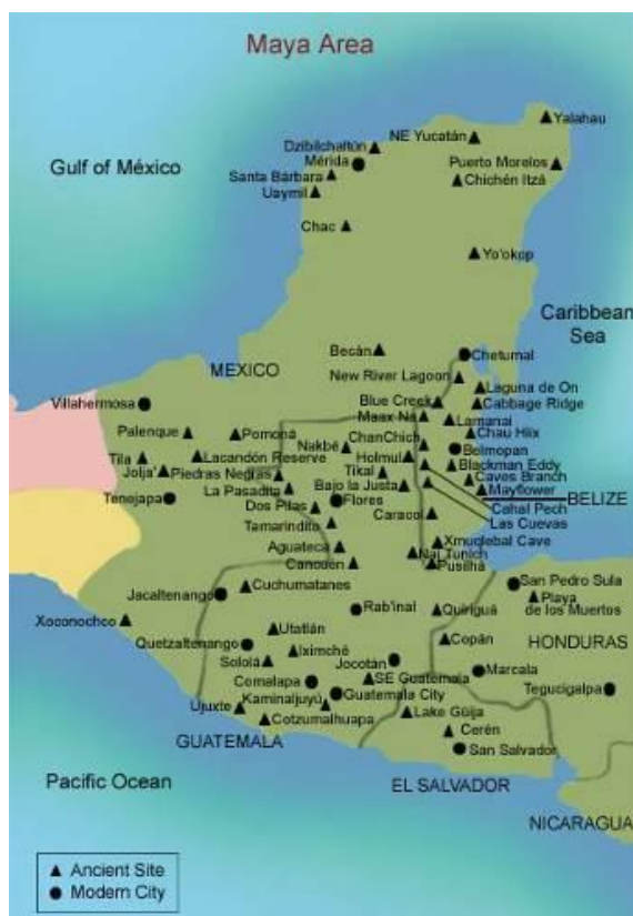
Illustration 1: The Map of the Mayan World located on the territory of five Central American countries of today: Mexico, Belize, Honduras, Guatemala and Salvador

As the territory of the Mayan Civilization, we take the region of today's Mexico (counties of Chiapas, Tabasco, Yucatán, Quintana Roo), Belize, Honduras, Guatemala and Salvador. The world of the Maya had three seabords: the Mexico Bay to the north, Caribbean (Atlantic Ocean) to the east and the Pacific Ocean to the west.