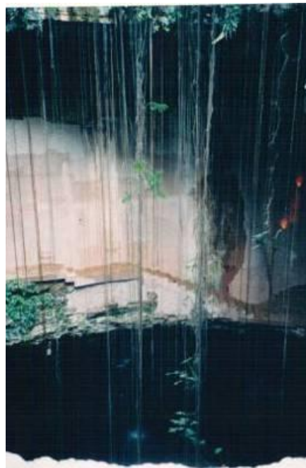
Photography 3: Cenote Aqua Azul, the wwsacred Mayan sinkhole, Chichen Itza, Yucatan, Mexico