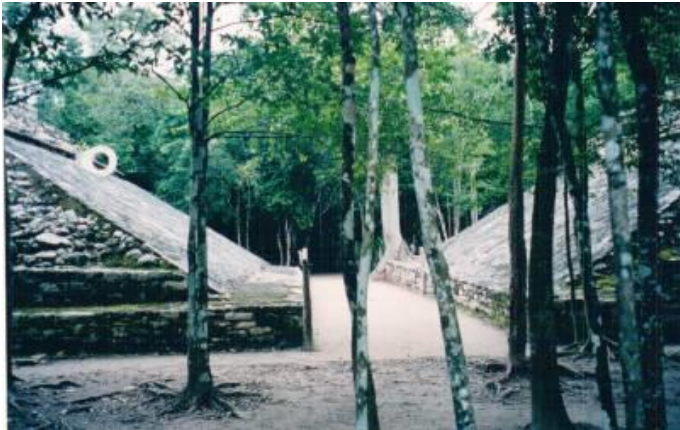
Photography 17: Play Field, Coba, Yucatán, Mexico