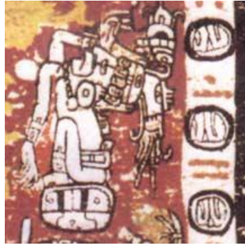
Photograph 7: Detail from the Mayan Paris Codex (69)