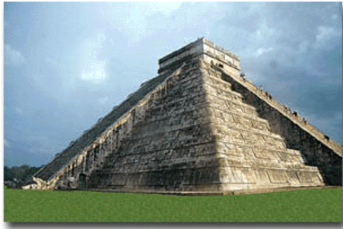
Photography 2: Kukulcan Pyramid during the spring equinox, the light phenomenon creates the illusion of the serpent on the stairs, only on the day of spring equinox, Chichen Itza, Yucatán, Mexico

We mentioned before the sun effect, which is created only on the day of the equinox in the example of the Kukulcan Pyramid (Chichen Itza, Mexico). Seven light triangles are created and together with the serpent's head at the foundation of the stairs they form a descending serpent. This is the symbolism on the astronomical, architectural and philosophical level.