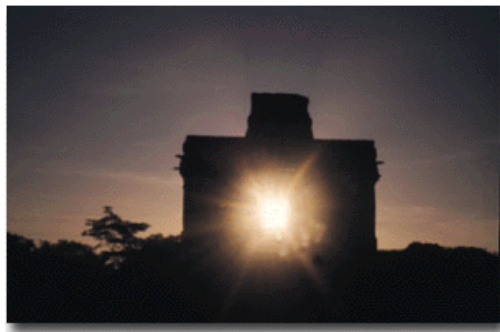
Photography 1: Mayan Temple built in such a way, that the Sun appears full size in the central aperture only on the day of spring and autumn equinox, Dzibilchaltun, Mexico

Another example of the brilliant link between astronomy and architecture can also be seen on the Temple (“seven puppets”) at Dzibilchaltun in Yucatán (Mexico). With their extraordinary performance, Mayan builders allowed the sunlight to shine fully only during the annual equinox. In this way the Maya had shown the mastery in both disciplines.