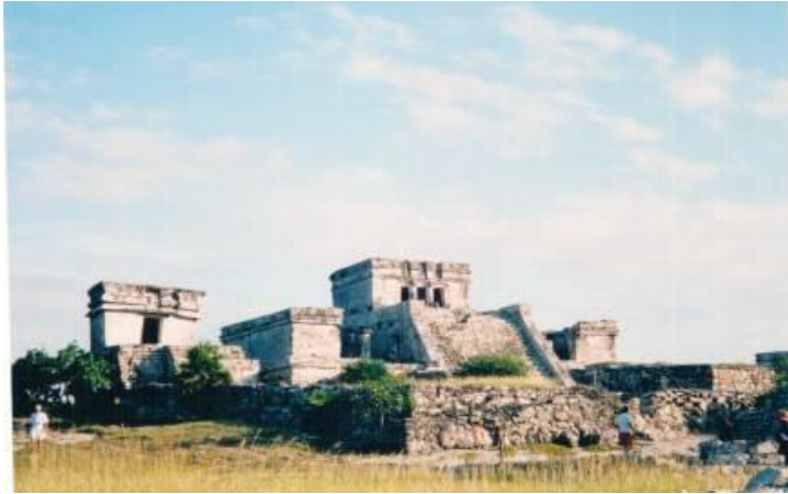
Photography 10: Whistle from Tulum, Quintana Roo, Mexico