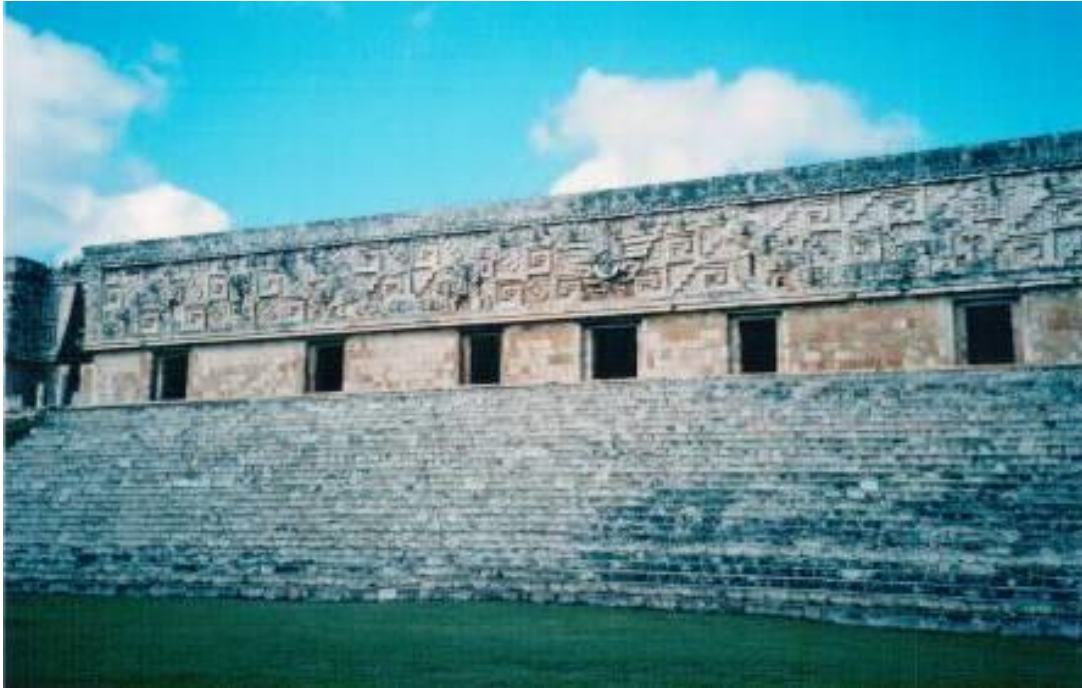
Photography 6: The “Governor’s Palace”, Uxmal, Yucatán, Mexico