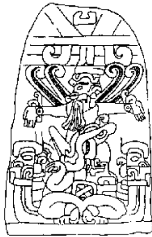
Illustration 12: Stela number 11 from the ancient Mayan city of Izapa, Mexico, shows the Cosmic Father inside the Cosmic Mother's "mouth"; representing the "birth canal" (Milky Way Galaxy) which will culminate on December 21, 2012, when the prophesized planetary disposition of the planets and the stars occurs in the sky. (76)

The question which will remain unanswered is how the Maya knew about this cosmic cycle. It was obviously necessary that the civilisation had the concept about (a) the existence of the solar system, (b) the existence of the galaxy as a complex set of solar systems, (c) the movement of the solar system within the galaxy, and (d) the periodicity, i.e. laws governing this movement.