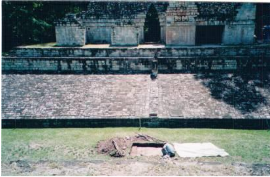
Photography 16: Play Field, Copan, Honduras