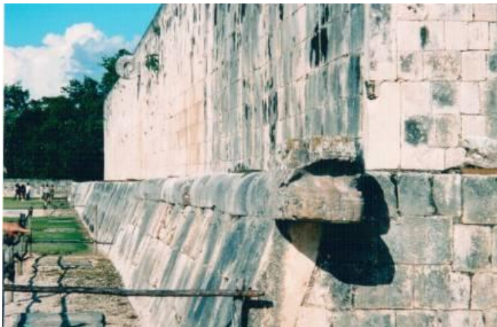
Photography 9: Acoustic wall at the Play Field, Chichen Itza, Yucatán, Mexico