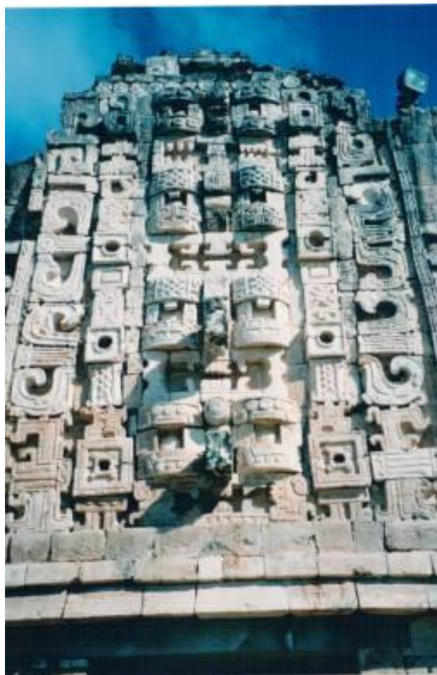
Photography 7: “Five-to-eight”, façade of the Governor’s Palace, Uxmal, Yucatán