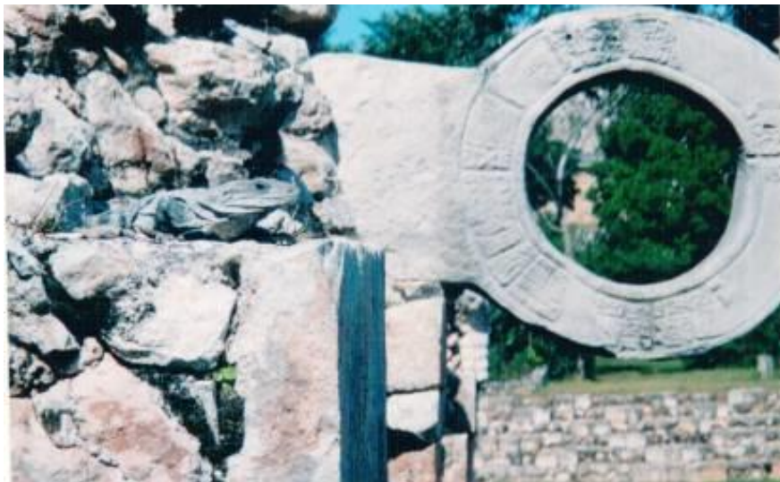
Photography 19: Stone ring at the Uxmala Play Field, Yucatán, Mexico