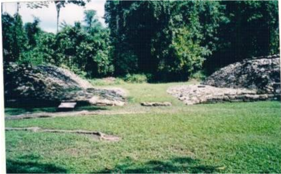
Photography 18: Play Field, Yaxchilan, Chiapas, Mexico