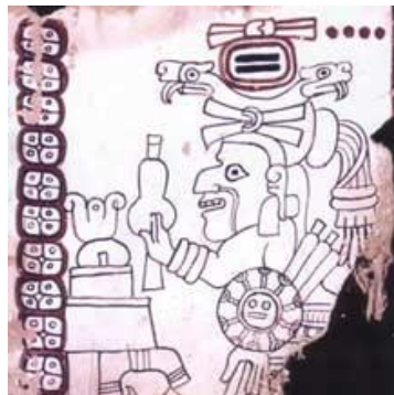
Photograph 8: Detail from the Grolier Codex

The fourth surviving Codex was discovered in Mexico in 1965 in a cave near the small city of Sierra de Chiapas. Its authenticity was verified by Mexican archaeologist Dr. Jose Saenz. (67) The Codex had been severely damaged, and its contents is mainly astrological in character, it describe the orbit tables of Venus. In 1971 it was sold to the Grolier's Club in New York and subsequently named after it.