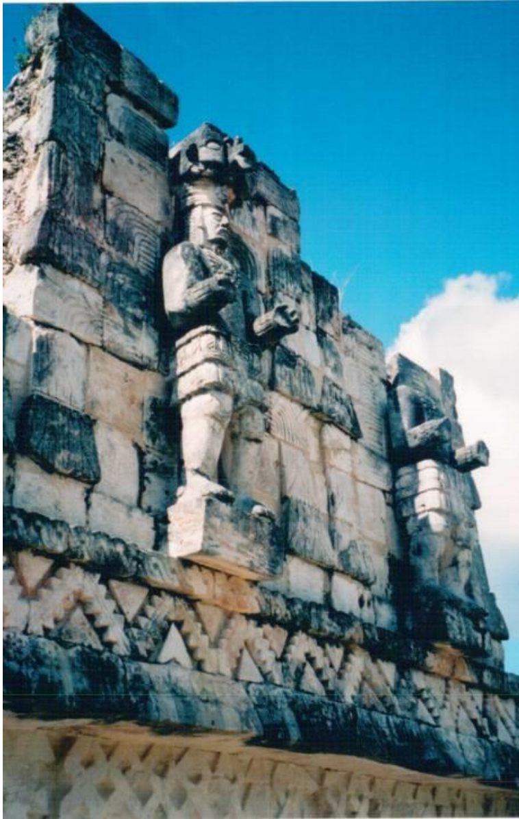
Photography 20: Stone figures of the Maya in the city of Kabah, Yucatan, Mexico