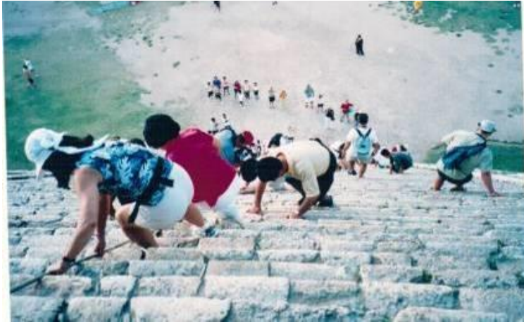
Photography 12: Disproportionately high and narrow stairs of the Kukulcan Pyramid, Chichen Itza, Yucatán, Mexico