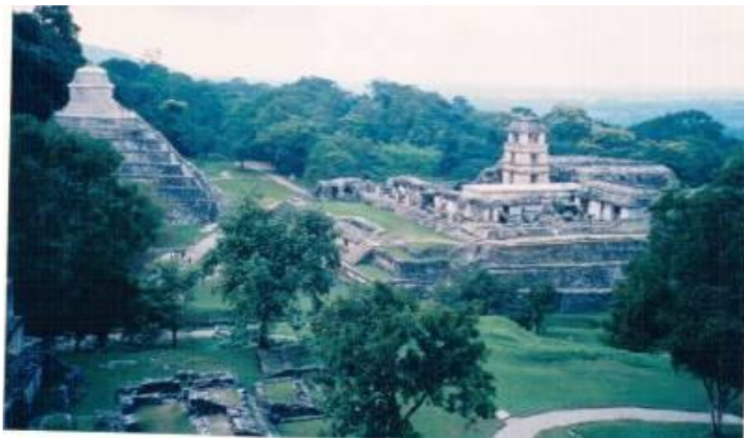
Photography 13: Palenque, Chiapas, Mexico