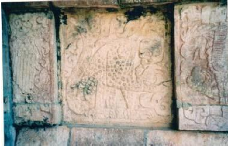
Photography 2: Stone blocks with engraved images of the jaguar and eagle, Chichen Itza, Yucatan