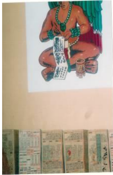
Photograph 5: Replica of the Mayan Codex, Guatemala City

The authors of the codices had been specially trained. This was because, according to the Maya, the content of the codices was associated with the heavens. The writer had to be “in contact with the gods” and therefore a book is a “sacred object”.