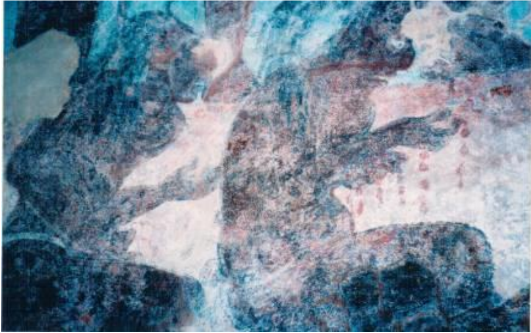
Photography 4: Mayan murals from Bonampak, Chiapas, Mexico