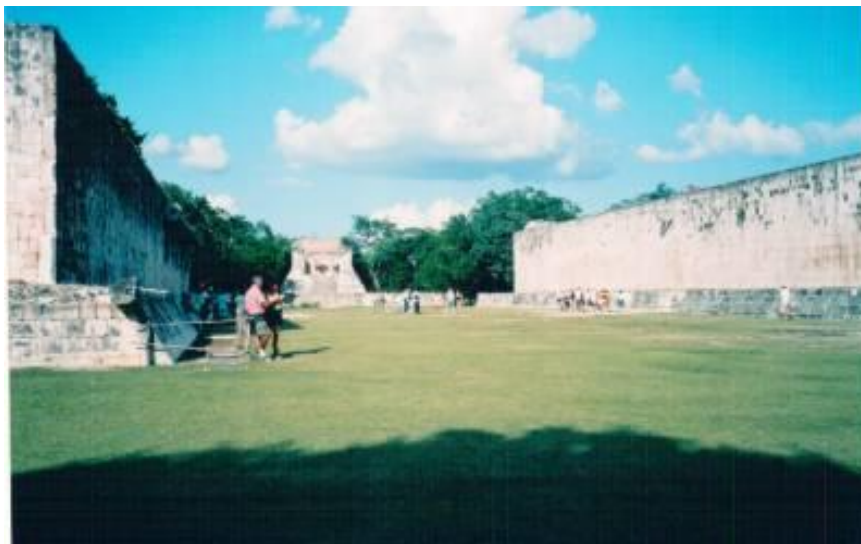
Photography 15: Play Field, Chichen Itza, Yucatán, Mexico