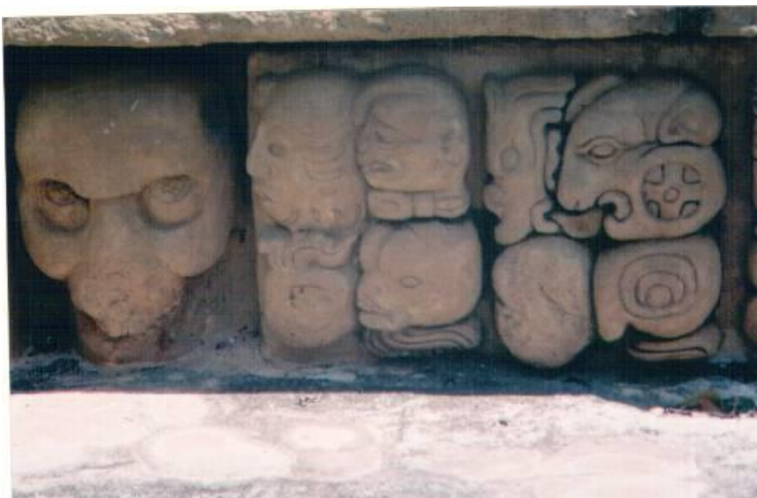
Photography 3: Mayan Petroglyph, Copan, Honduras

Mayan pictographs had communicated with, merged and augmented one another.