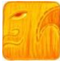
Illustration 13: Glyph which is pronounced “Ee”; in the upper right corner is the ear, symbolizing the life trajectory; the straight nose represents the stairs and this glyph symbolizes the life’s destiny, the path that is chosen and the initial energy needed to achieve the goals.

the form of an image. For example, the word “jaguar” is represented by the image of a jaguar’s head.