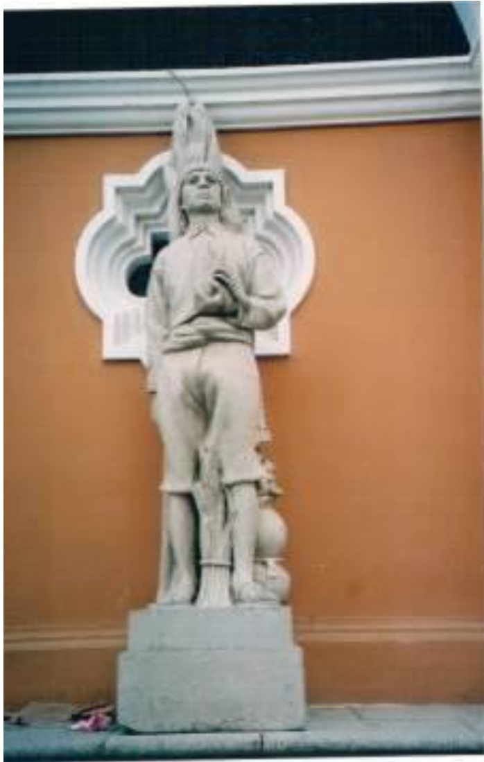
Photography 1: Mayan farmer, the perspective of Guatemalan artist, the statue is located at the entrance of the National History Museum in Guatemala City, Guatemala