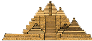
El Mirador, Guatemala