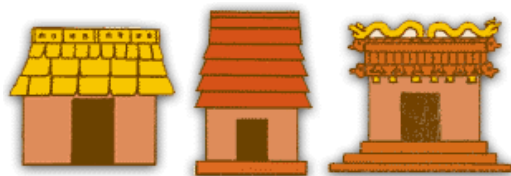
Illustration 11: Examples of Mayan House

Most Mayan residential buildings had been built of organic materials. A millennium later, the remains of their houses have not been preserved, but it is assumed that these looked like in the illustration above. Modest, but representing a permanent solution.