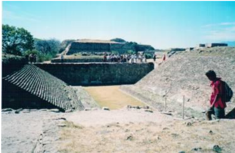
Photography 14: Play Field, Monte Alban, Oaxaca, Mexico