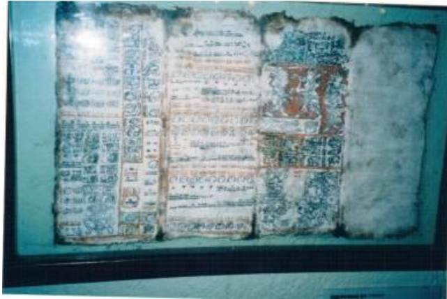
Photograph 6: Dresden Codex Replica, Chichen Itza, Yucatán, Mexico