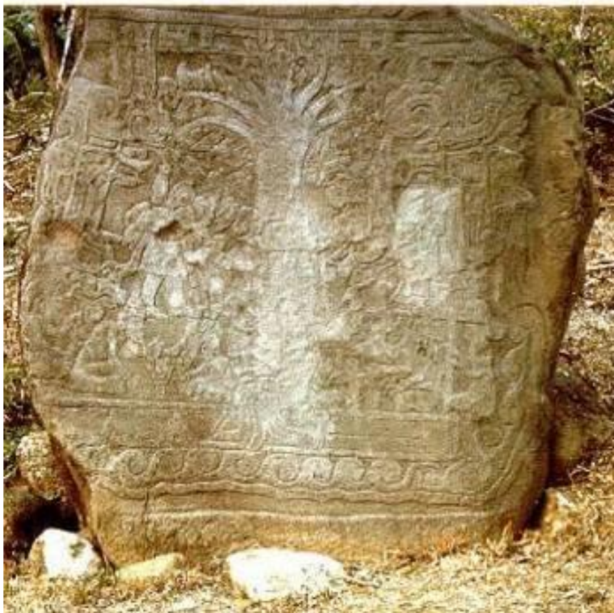
Photography 5: Stone stele number 5, Izapa, Mexico, 255 cm tall weighing 15 tons; dated 300 B.C.